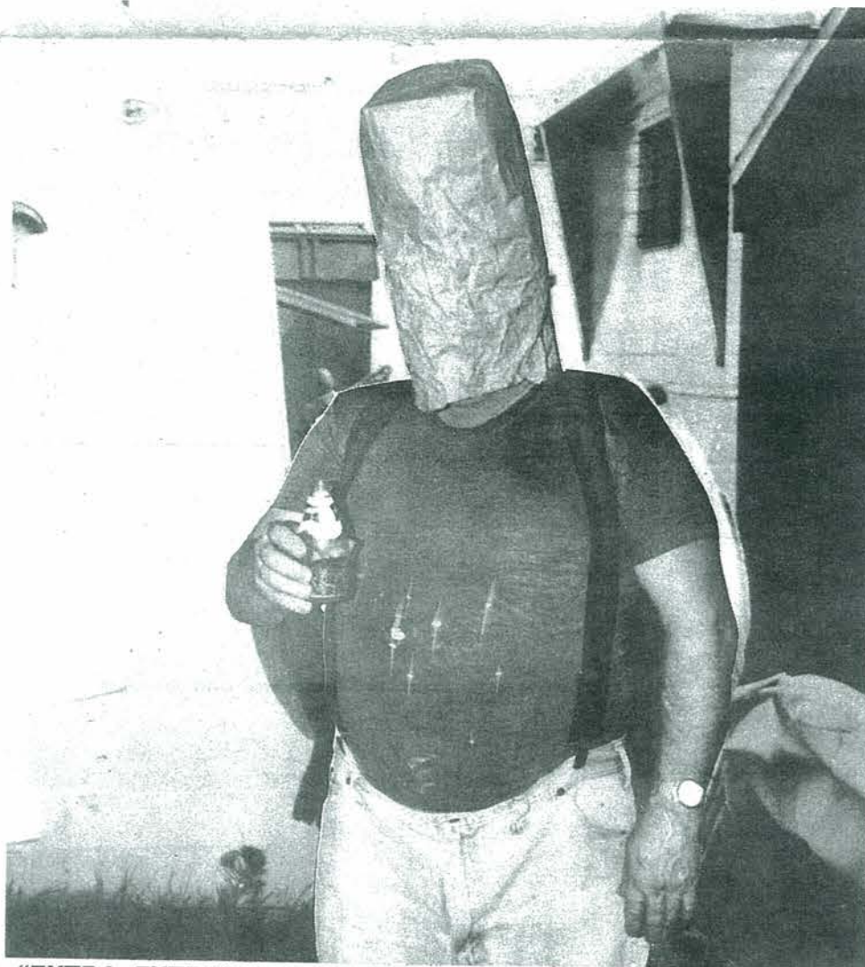
"EXTRA, EXTRA" PHANTOM NETTER — SAVER EXPOSED "Booze, Base" Operating under assumed identity. Charges pending on allegations of corruption. "Booze, Base" suspected of directing netters to best fishing holes. Exposed Thursday, 8/30/84, at 9:04 p.m. while giving directions to 61°, 1.5 miles off "A BUOY" to be unmasked February 9, 1985, in Spring City, Pa.