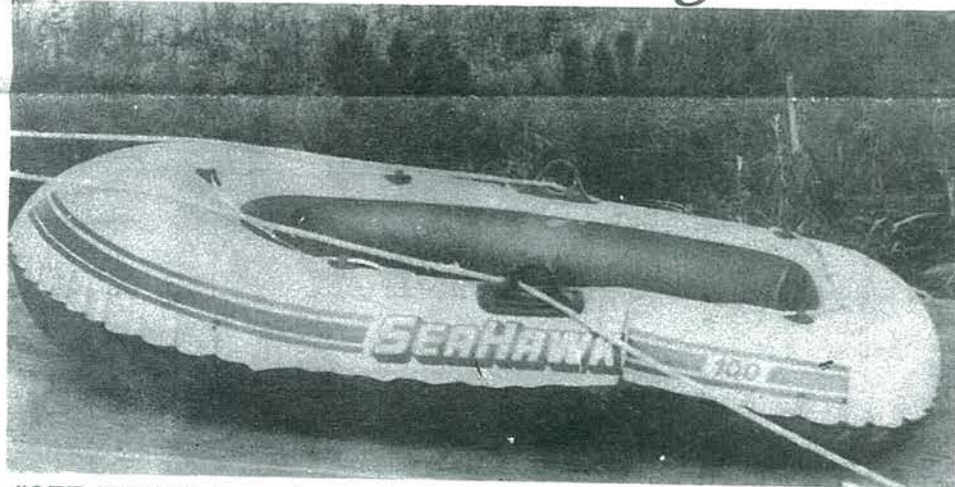
"SEE HAWK" for sale, contact Jim O'Connor at Banquet (all bids accepted).