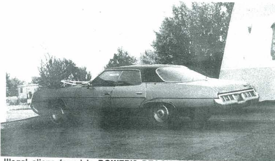
Illegal aliens found in BOWER'S BEACH. Migrant farm laborers caught living in a big green Chevrolet Impala with fraying vinyl roof. Anyone knowing the owner of this car contact U.S. Immigration Officers at Liberty Firehouse, February 9, 1985 beginning at 6:00 p.m.