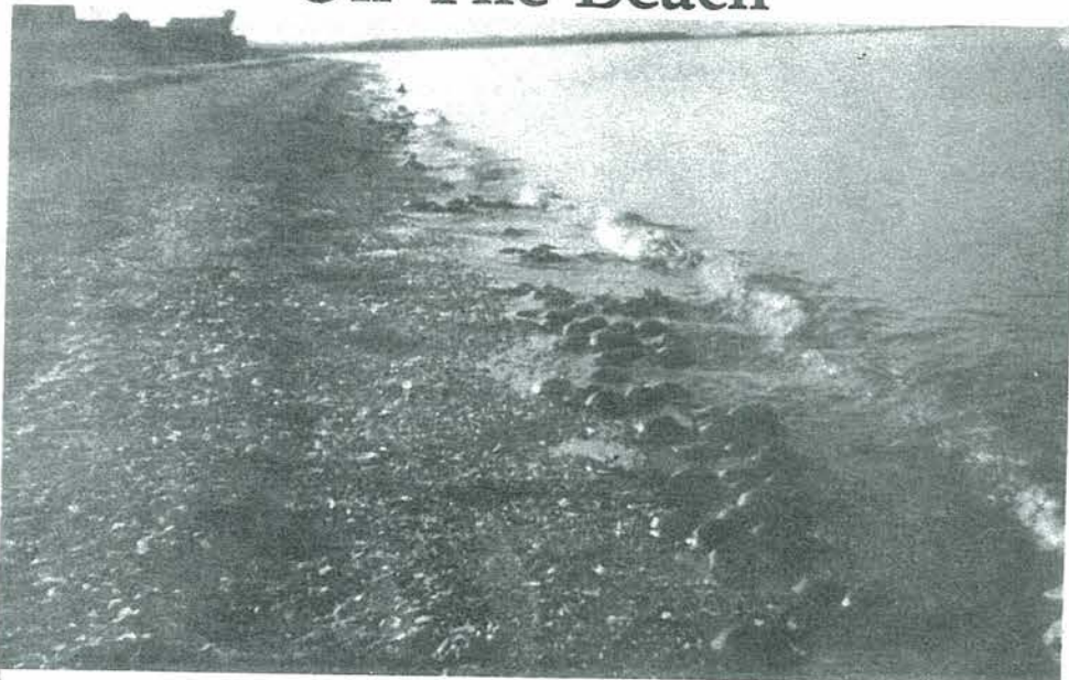
Horseshoe Crabs Invade Bowers